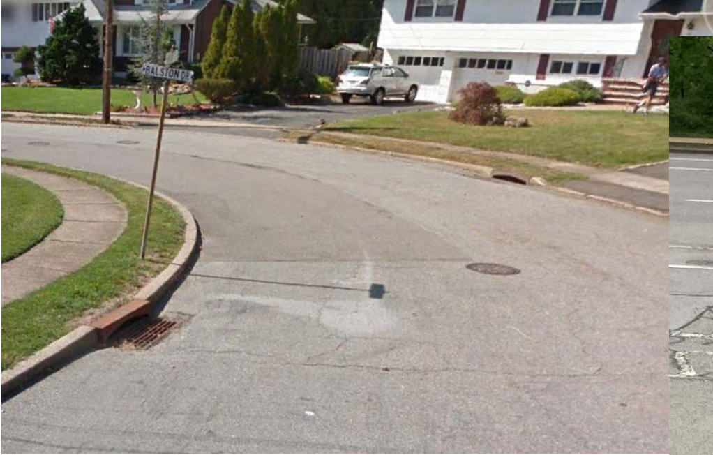
Collapsed Inlet - Non-NJDEP Approved Curb Pieces Non Bicycle Safe Grates