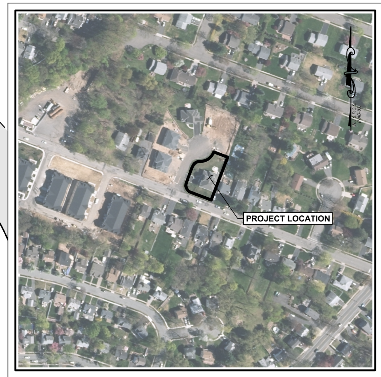
REFERENCE - NJGN 2015 ORTHOPHOTOGRAPHY, M-SID TILE(S) J5C11.